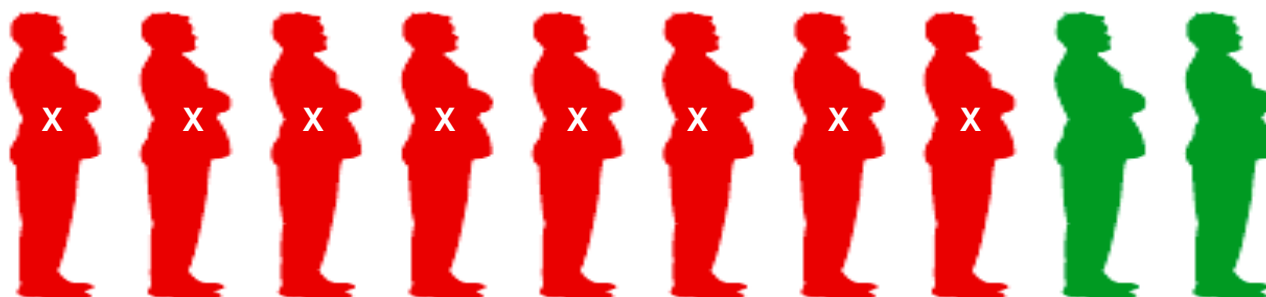
Fig 2: Only 2 out of 10 actively-managed funds outperform the SA Index

Source: Profile Data, General Equity Unit Trusts versus FTSE JSE All Share Index 20 years to Dec. 2009